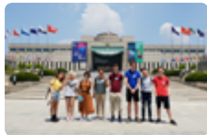
Korea War Memorial

We invite Korea Working Holiday participants to variety events every quarter to provide various experiences while their stay in Korea.