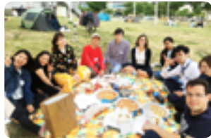
Han River Picnic