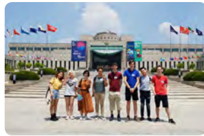
Korea War Memorial