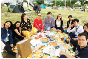
Han River Picnic